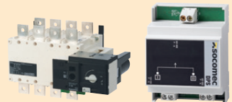
ATyS r Transfer Switching Equipment