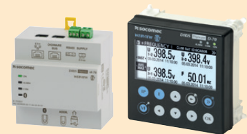
DIRIS Digiware M-70 & D-70