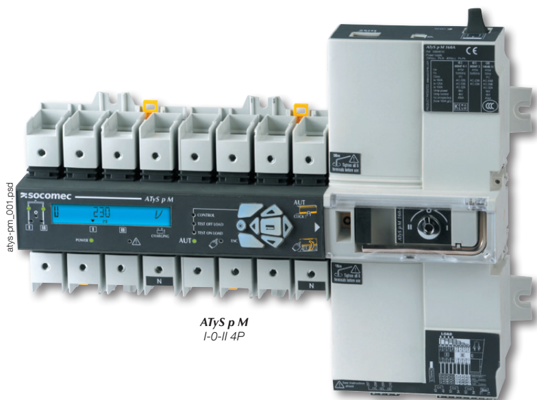
ATyS p M I-O-II 4P

Automatic Transfer Switching Equipment from 40 to 160 A